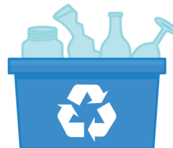
GLASS RECYCLE BIN