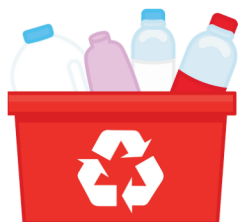
PLASTIC RECYCLE BIN

Try to find everything on the list below. Check the box when found.