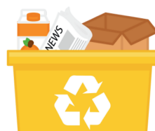
PAPER RECYCLE BIN